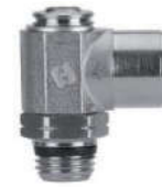
PCBFC & PCBFC-R